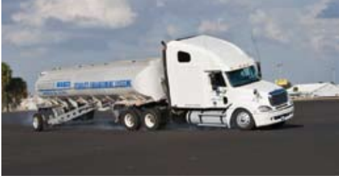
40 mph, System Off