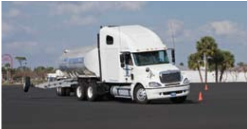
40 mph, System On